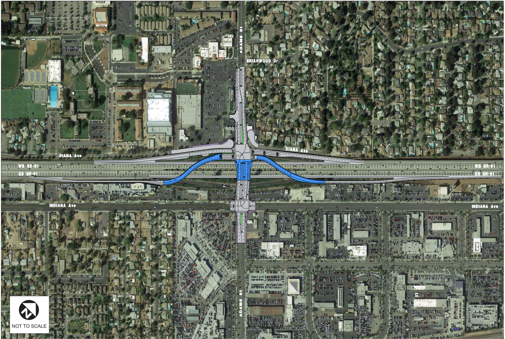
SR-91/Adams Street Interchange Reconfiguration PA/ED