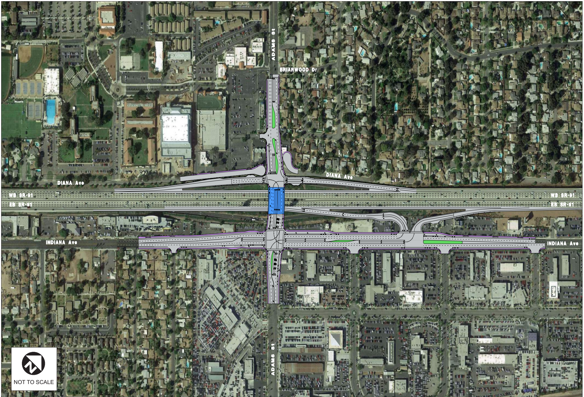
SR-91/Adams Street Interchange Reconfiguration PA/ED